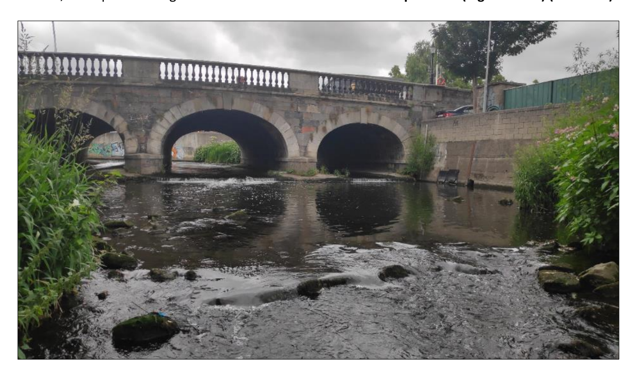
Plate 3.1 Representative image of site 1 on the River Tolka, facing upstream towards Frank Flood Bridge)

Given the presence good quality salmonid, lamprey and European eel habitat and otter utilisation of the site, the aquatic ecological evaluation of site 1 was of local importance (higher value) (Table 3.5).