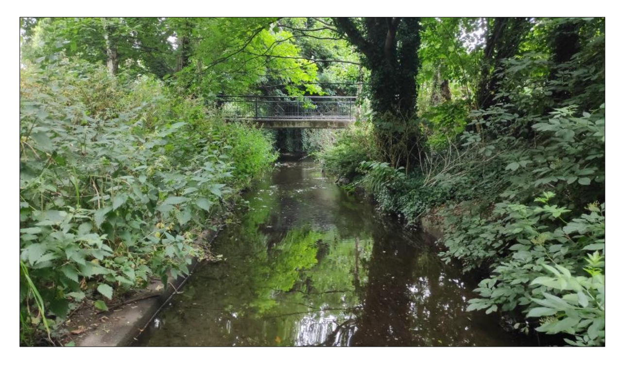
Plate 3.3 Representative image of site 3 on the River Poddle in Mount Argus Park, facing upstream to the existing footbridge illustrating the heavily modified nature of the channel

Given the poor-quality fisheries and aquatic habitats present, in addition to poor water quality, the aquatic ecological evaluation of site 3 was of local importance (lower value) (Table 3.5).