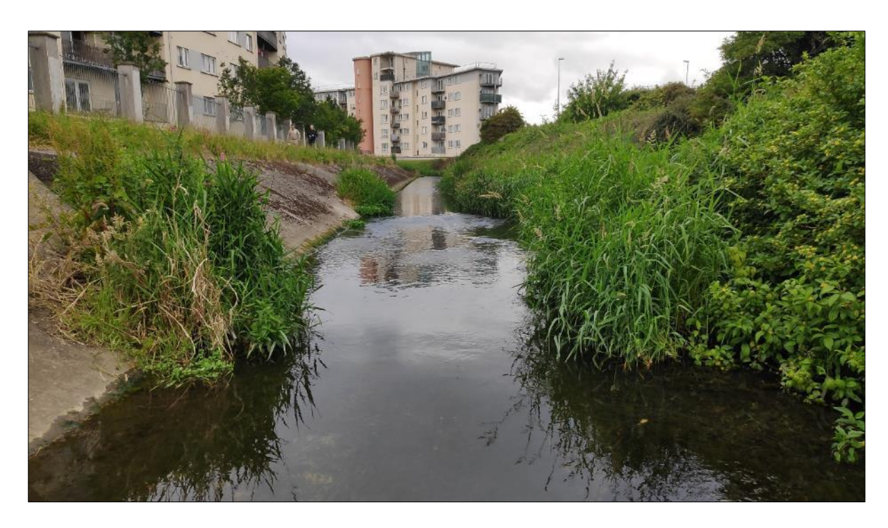
Plate 3.4 Representative image of site 4 on the River Camac, facing upstream towards Áras Na Cluaine