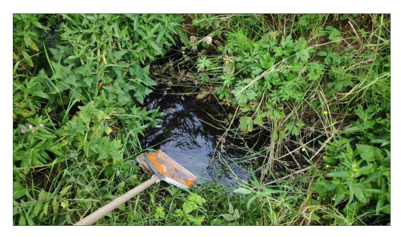
Plate 3.7 Representative image of site 6 on the upper reaches of the River Poddle