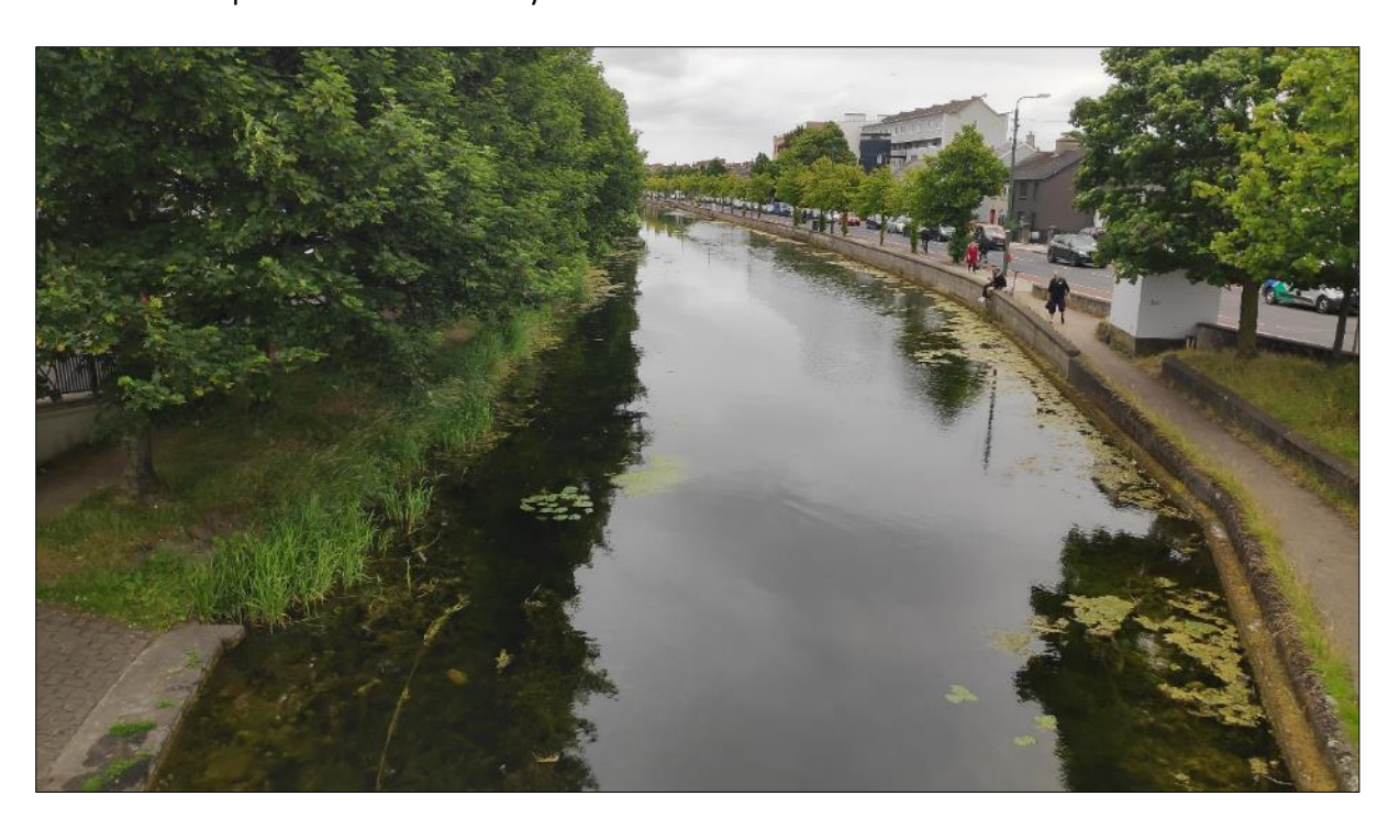
Plate 3.2 Representative image of site 2 on the Grand Canal at Emmett Bridge, facing eastwards from bridge

Given the location of the site within the Grand Canal pNHA (002104), the aquatic ecological evaluation of site 2 was of national importance ( Table 3.5 ). The site was also of high value for coarse fish species, Red-listed European eel and utilised by Annex II otter.