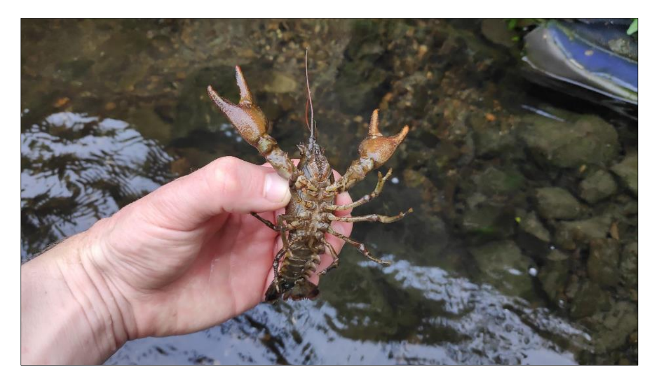
Plate 3.6 One of many white-clawed crayfish recorded from site 5 via hand searching in July 2022