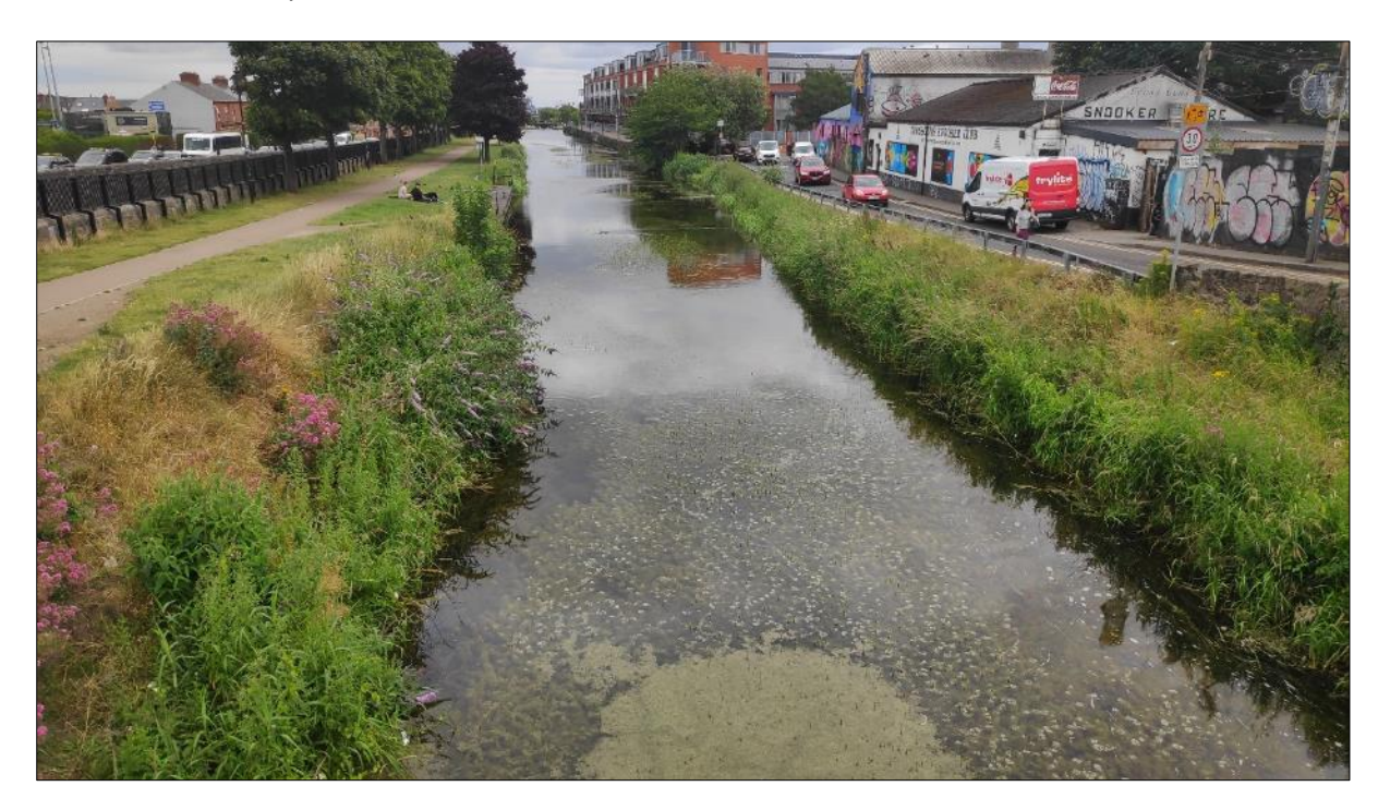
Plate 3.9 Representative image of site 8 on the Royal Canal at Phibsborough, facing downstream from Cross Guns Bridge to the 4<sup>th</sup> lock

Given the location of the site within the Royal Canal pNHA (002103), the aquatic ecological evaluation of site 8 was of national importance (Table 3.5). The site was also of high value for coarse fish species and Red-listed European eel.