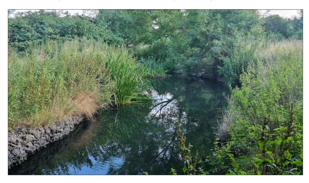
Plate 3.8 Representative image of site 7 on the River Tolka, facing downstream to meander from N3 culvert

Given the moderate value for salmonids, lamprey and European eel, in addition to otter utilisation, the aquatic ecological evaluation of site 7 was of local importance (higher value) (Table 3.5).