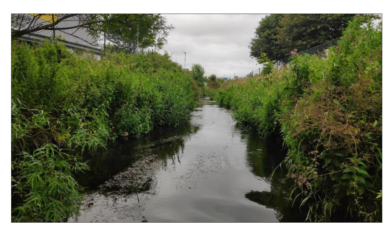
Plate 3.5 Representative image of site 5 on the River Camac, facing upstream from culverts